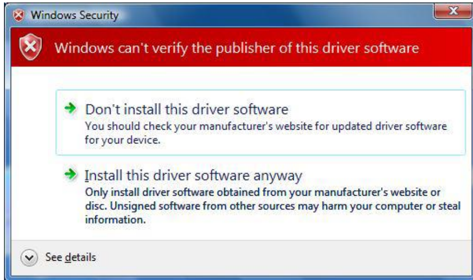
Figure 2: Windows 7 driver installation error message

It is recommended that older versions of OmniSEC be uninstalled before version 5.12 is installed. This should be done following the uninstall procedure below. Double-click on the OmniSEC installer and follow the on-screen instructions. When the Zetasizer \mu V is connected, the USB driver will be installed and the following message may appear twice: