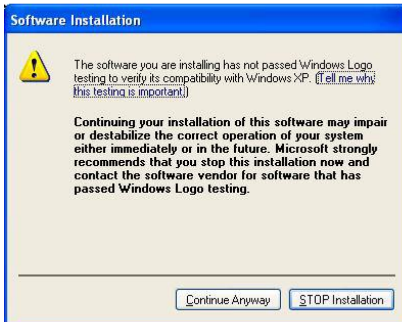
Figure 1: Windows XP driver installation error message

It is recommended that older versions of OmniSEC be uninstalled before version 5.12 is installed. This should be done following the uninstall procedure below. Double-click on the OmniSEC installer and follow the on-screen instructions. When the Zetasizer \mu V is connected, the USB driver will be installed and the following message will appear twice: